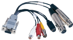
Breakout Cable (included)